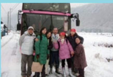
Visit homes by bus.