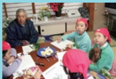
It is Japanese study.