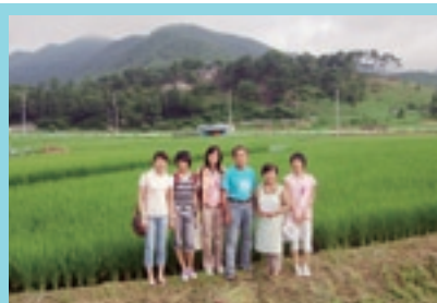
Everywhere is green. It's been delightful.