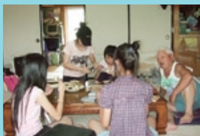
It's a rare dish.