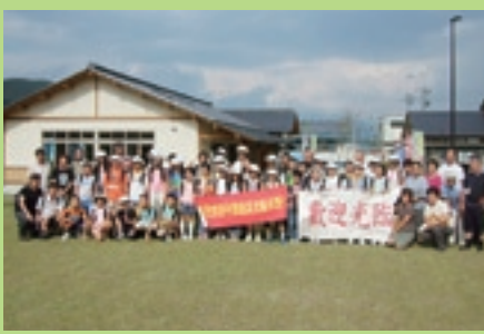
With brought banners up

Contact with Japanese agriculture, environment and culture in farm villages and schools to study future agriculture and earth.