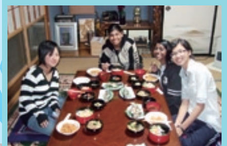
We prepared meal together.