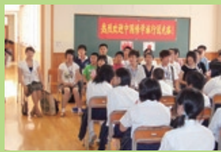
Face-to-face ceremony is performed exchanging songs.