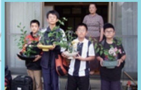
I did Japanese flower arrangement.