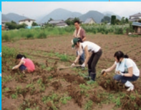
Help harvesting vegetables.