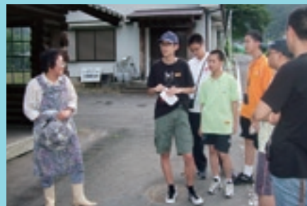
I have come walking through the village.