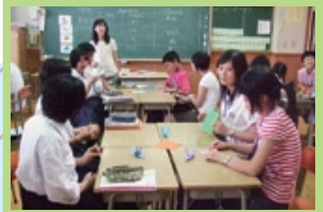
Study facing each other