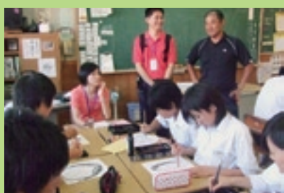
Attend the class together.