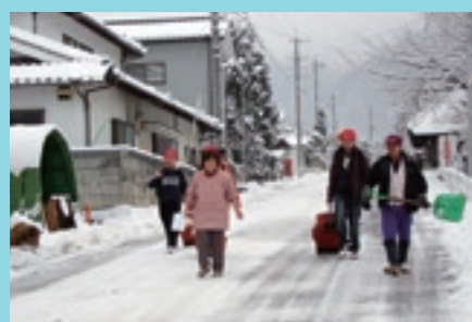
Be careful not to tumble