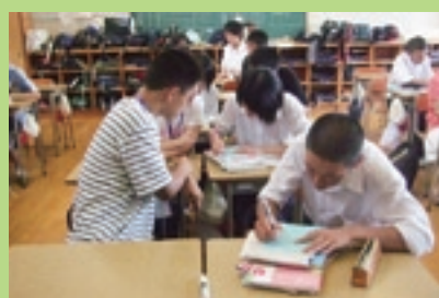
Let's exchange e-mail.