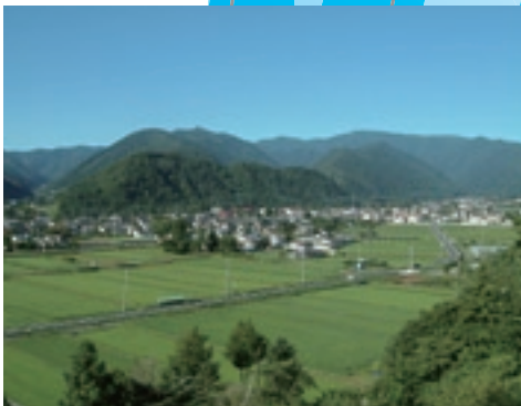
Green and beautiful farm villages