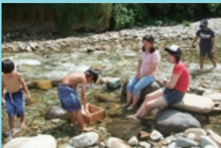
Rivers are really beautiful.